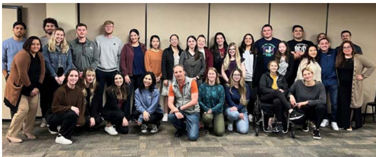
WAHEC Scholars and Faculty Mentors

In FY24, 17% of trainee hours reported by the Rural Health Professions Programs (RHPP) at an Arizona Board of Regents public university were also supported by an AzAHEC Regional Center with a preceptor, housing and/or stipend.