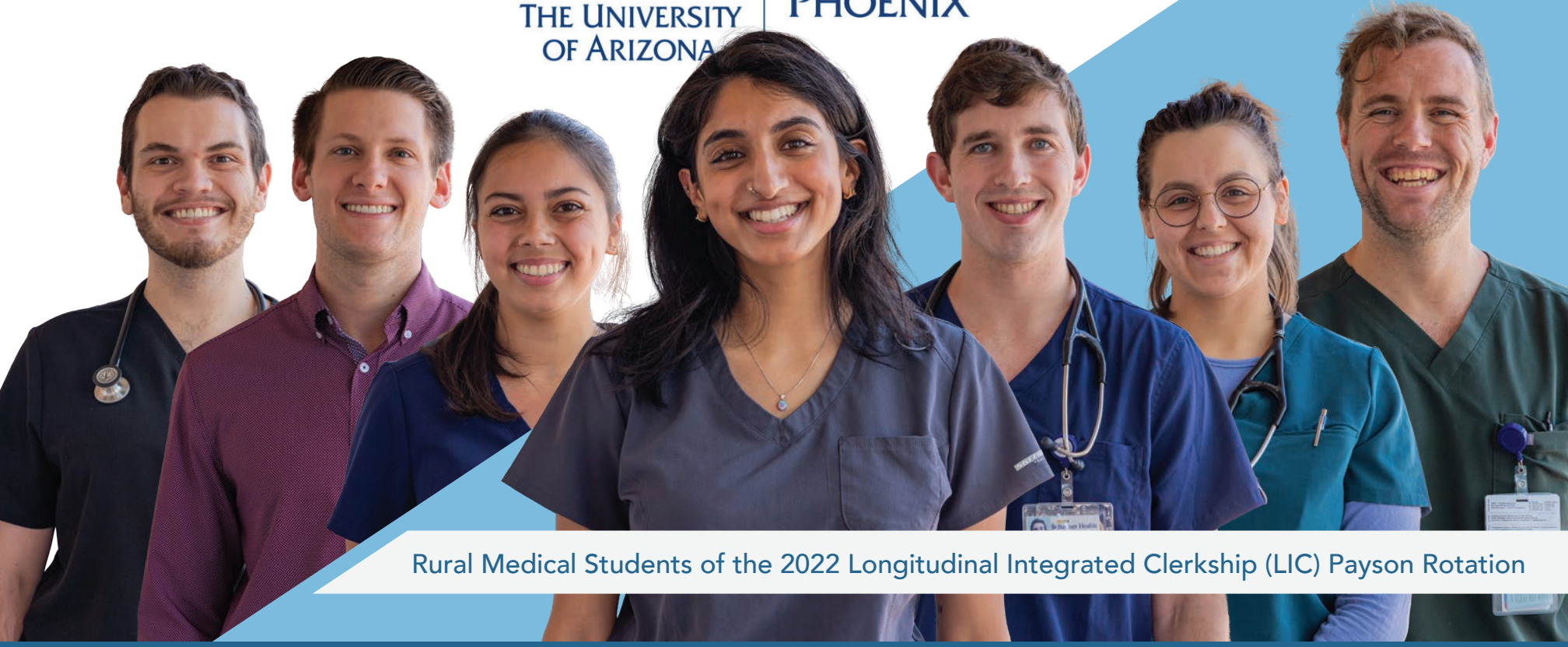
Rural Medical Students of the 2022 Longitudinal Integrated Clerkship (LIC) Payson Rotation

The Center for Excellence in Rural Education will partner with AzAHEC in several initiatives. These include the Area Health Education Centers Scholars program, Community-Based Experiential Training opportunities, sponsoring Continuing Education events for existing practitioners, promoting healthcare education programs for students in grades 9-16, and offering health education opportunities to the public.